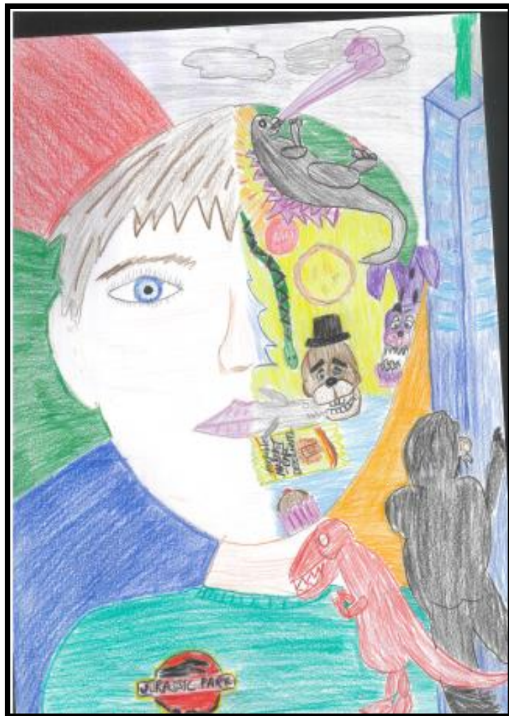
Artwork by Lachie