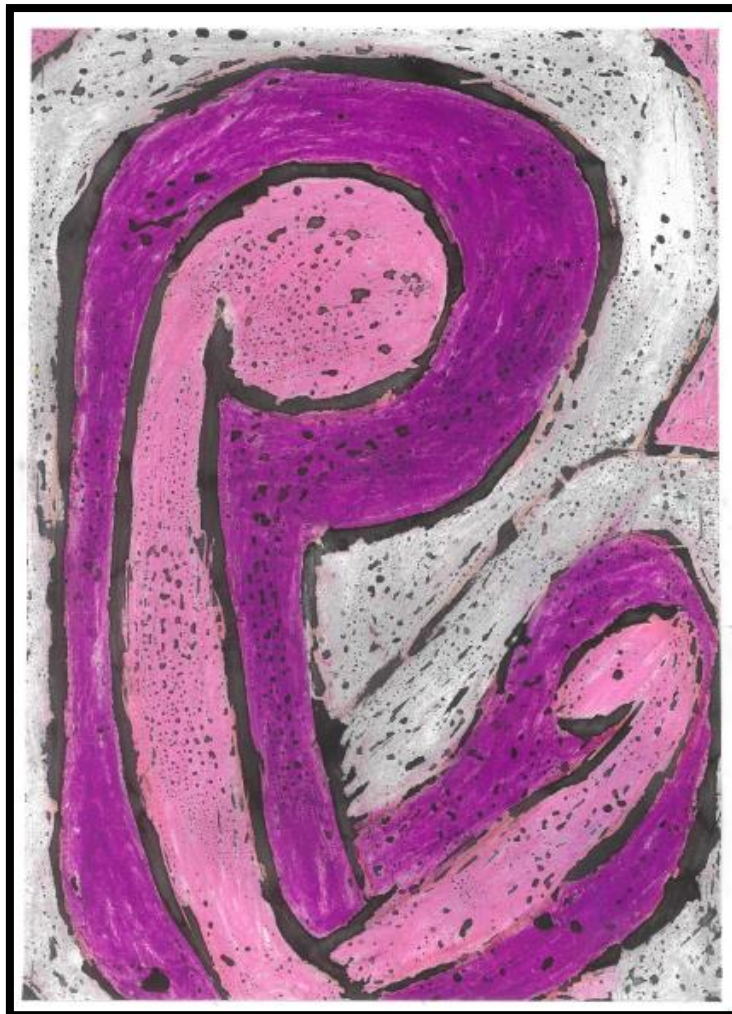
Artwork by Xela