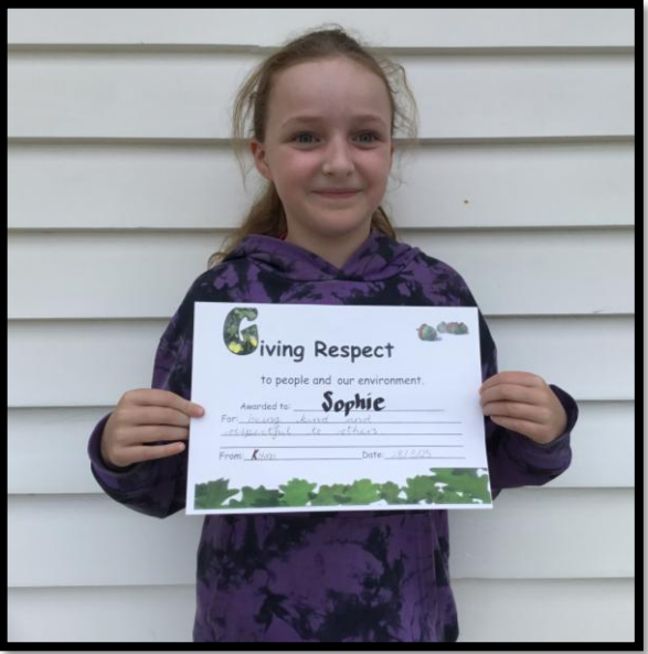
Readers of the Week